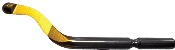
Blade Number 1:

Exciting Update! Our new robotic coating system for SHAVIV E-Series blades (E100P, E110P, E111P, E200P, E300P) represents a leap forward in precision manufacturing. This upgrade introduces a subtle 2-3 mm visual change while maintaining the outstanding performance you've trusted. Same great blades, smarter production!